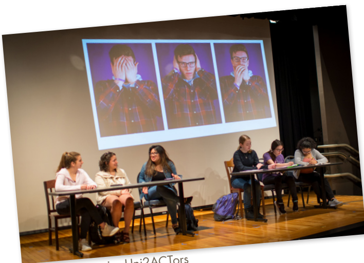
Classroom gossip, Uni2ACTors